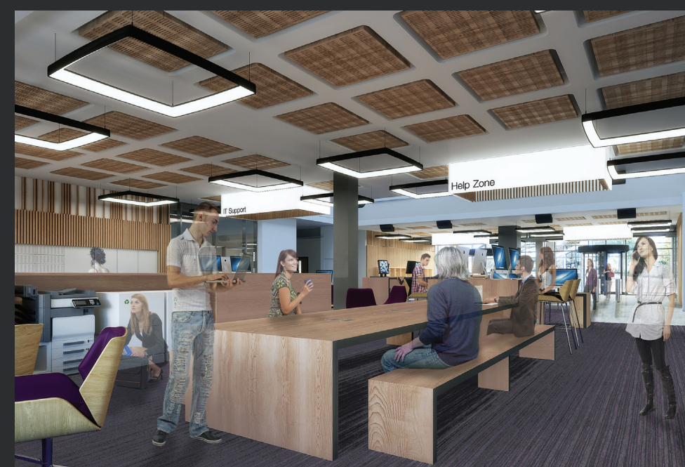
Edward Boyle Library