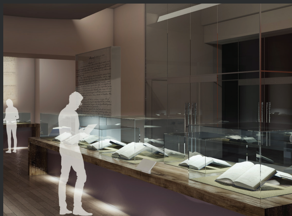
Treasures Gallery in the Parkinson Building

Transformation of the University campus is well underway now. The significant portfolio of new building and refurbishment projects due to be delivered over the coming years is part of the ambitious £520m campus development investment.