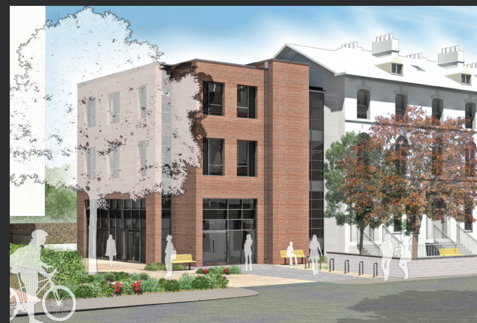
Institute for Transport Studies